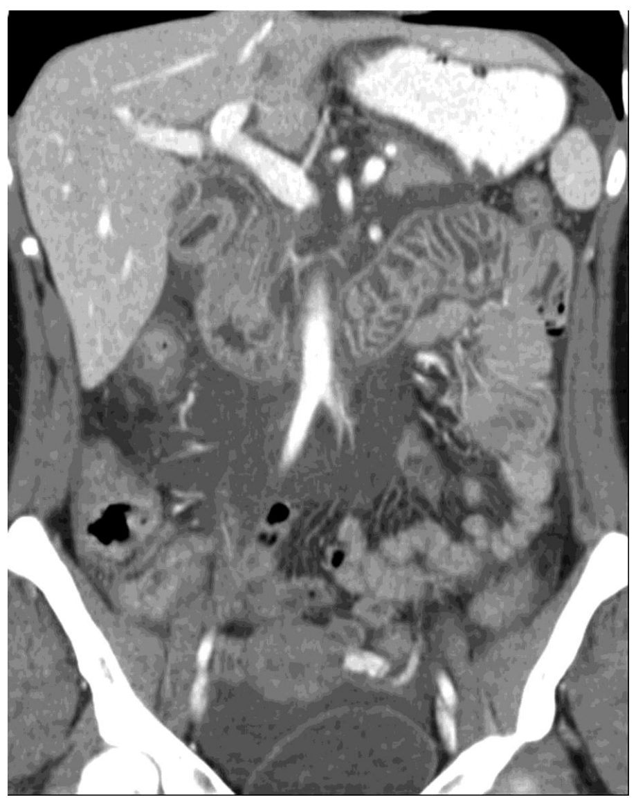
Vallurupalli K, Coakley K J AJR 2011;196:W405-W411

—Contrast-enhanced abdominopelvic 64-MDCT (Definition, Siemens Healthcare) of 22-year-old woman with acute-onset abdominal pain started on angiotensin-converting enzyme inhibitor 1 day before presentation.